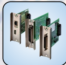
Plug-In Interface Modules