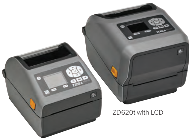
ZD620d with LCD

When print quality, productivity, application flexibility and management simplicity matter, the Zebra ZD620 delivers. As the next generation in Zebra's desktop printer line, the ZD620 replaces Zebra's popular GX Series and ZD500 printers, rising above conventional desktop printers with premium print quality and state of the art features. Available in both direct thermal and thermal transfer models, as well as healthcare-specific models, the ZD620 meets a wide variety of application requirements. It offers the most standard features of any Zebra desktop printer, including an optional 10-button user interface with a color LCD that takes all the guesswork out of printer setup and status. The ZD620 runs Link-OS® and is supported by our powerful Print DNA suite of applications, utilities and developer tools that deliver a superior printing experience through better performance, simplified remote manageability and easier integration. The Zebra ZD620 — delivering the print speed, print quality and printer manageability you need to keep your operations moving forward.